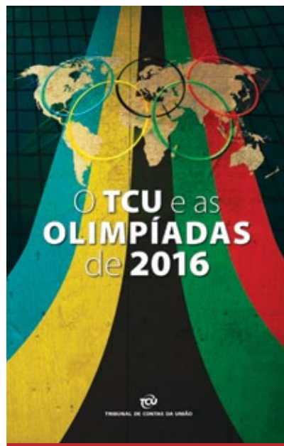
"TCU and the 2016 Olympics" report cover

One of the first control actions performed by TCU was an audit in order to evaluate the management and organization of the Olympic Games. According to the report, the governance of the Games still suffers from a lack of establishment of deadlines, values and responsibilities for actions that need to be developed. Less than three years before the world event, Brazil has not yet produced the document indicating the essential projects and corresponding responsibilities (responsibility matrix).